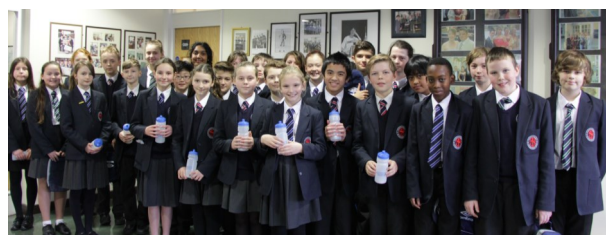
Year 7 pupils receiving their awards this morning

One of our college aims is to 'secure and celebrate achievement' and to ensure our young people know the importance of having a positive attitude to learning. I recently asked teachers to nominate pupils who, in their opinion, deserved some formal recognition for excellent attitude towards their work this year. Huge numbers were nominated and the top 15+ in each year were put forward. I met them today, told them how pleased I was with their excellent approach to their studies and gave them each a small gift as a reward.