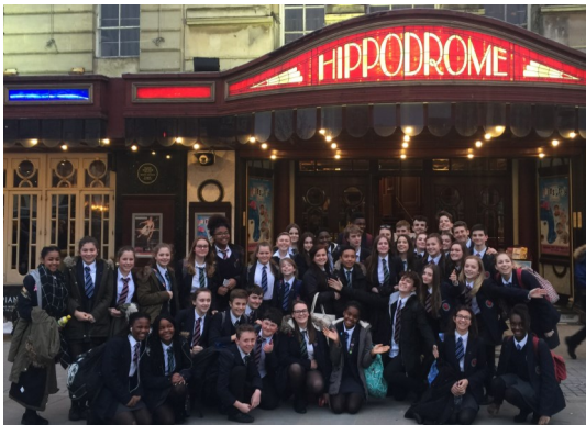
The St. Bede's cast of Hairspray visited Bristol Hippodrome to watch the West End Production last week. It was fantastic!