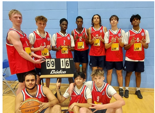
Senior Basketball team