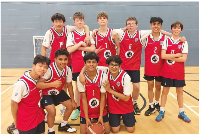
Junior Basketball team

Congratulations to two talented squads. Your hard work exemplifies our St Bede's Way principles. We are proud of you.