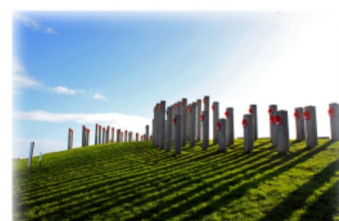
St Bede's Calendar 2019

The calendar costs £5.00 and proceeds will be split between our college charities. We are taking orders at break time and delivery is expected by the end of next week. Just in time for Christmas.