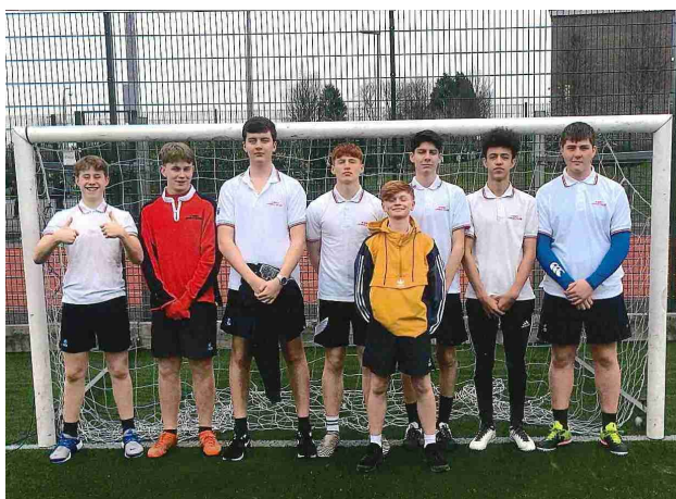
Team Beskitas—Year 9, 10 and 11 winners