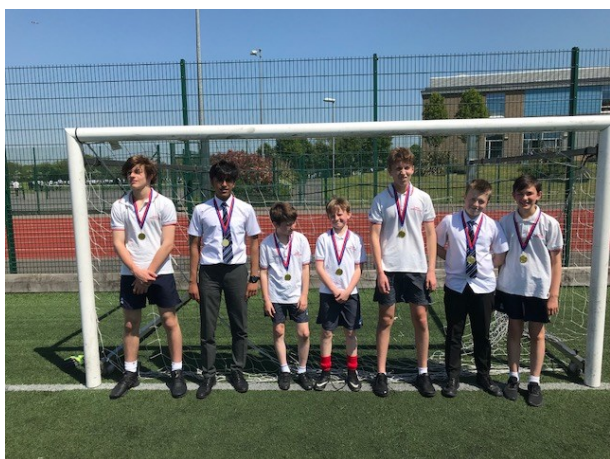
Team Arsenal—Year 7 and 8 winners